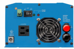
Phoenix Inverter 12/800 with Nema 5-15R socket