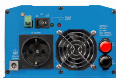
Phoenix Inverter 12/800 with Schuko socket