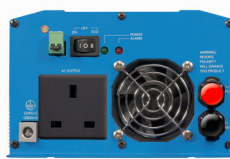
Phoenix Inverter 12/800 with BS 1363 socket