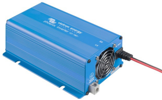
Phoenix Inverter 12/180