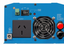
Phoenix Inverter 12/800 with AN/NZS 3112 socket