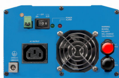
Phoenix Inverter 12/800 with IEC-320 socket