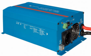
Phoenix Inverter 12/800 with Schuko socket