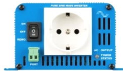
Phoenix Inverter 12/180 with Schuko socket