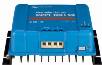
Solar Charge Controller MPPT 100/50